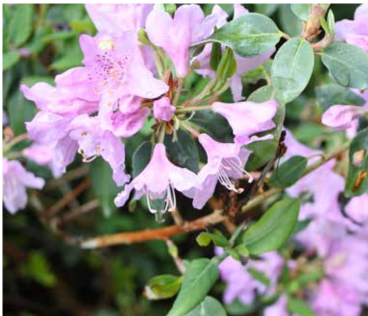
Rhododendron oreotrephes 'Bluecalyptus'.

From among the many individual plants to which one could draw attention, let me merely mention personal delight in a superb Magnolia 'Sayonara', clumps of Rhododendron exasperatum displaying immaculate foliage and perfect habit, R. oreotrephes 'Bluecalyptus' looking equally perfect, a deep yellow R. cinnabarinum subsp. xanthocodon Concatenans Group, and a demure R. cerasinum 'Cherry Brandy'.