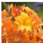
Azalea Sun Star

We grow one of the finest ranges of Rhododendrons and Azaleas in the country. Everything from historic varieties rescued from some of the great plant collections, to the latest introductions from around the world.