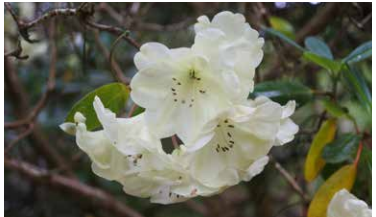
Rhododendron 'Zelia Plumecocq'