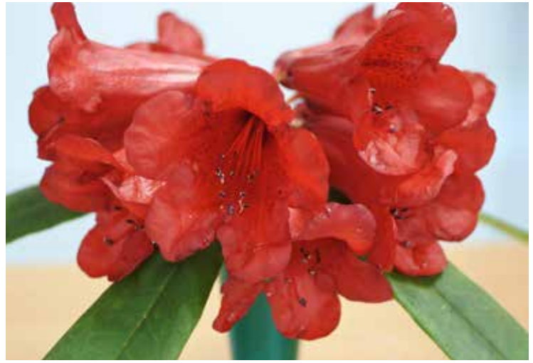
Rhododendron 'Dukeshill' exhibited by the Crown Estate.