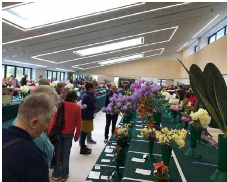
General view of the show at Rosemoor.