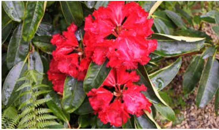
Rhododendron 'Markeeta's Prize'.