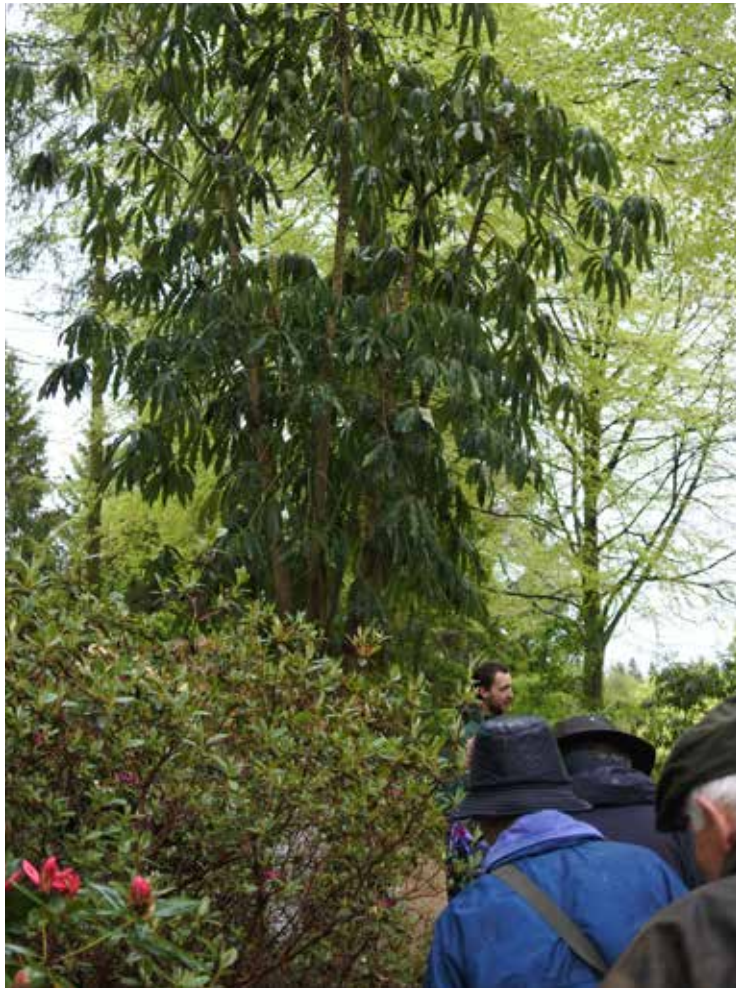
Phil Cormie talking to members of the group beside a fine specimen of Schefflera impressa GWJ 9375.

From among the many individual plants to which one could draw attention, let me merely mention personal delight in a superb Magnolia 'Sayonara', clumps of Rhododendron exasperatum displaying immaculate foliage and perfect habit, R. oreotrephes 'Bluecalyptus' looking equally perfect, a deep yellow R. cinnabarinum subsp. xanthocodon Concatenans Group, and a demure R. cerasinum 'Cherry Brandy'.