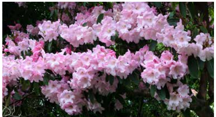
A 90 year old specimen of Rhododendron 'Loderi Venus' which records show to have been bought from the Crown Commissioners