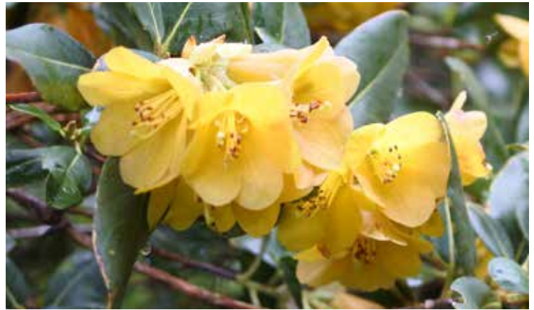
Rhododendron cinnabarinum subsp. xanthocodon Concatenans Group.