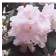
Loderi Pink Diamond