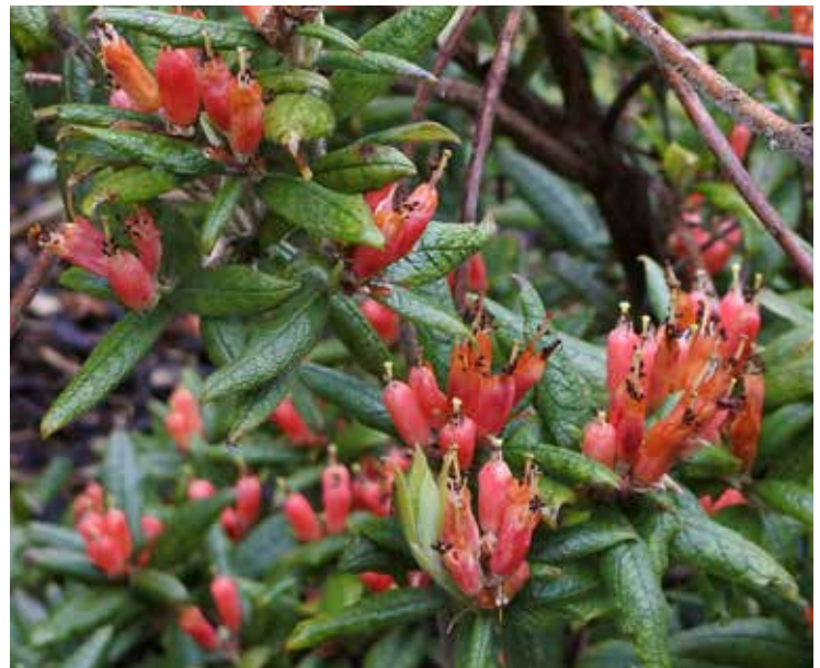
Rhododendron spinuliferum in bloom at the Himalayan Garden.

Although we admired especially the rhododendrons – both the species, in incredible numbers (over 600 of them), and the many hybrids – other fine things have been planted, including scheffleras, embothriums, rare viburnums and bamboos, interspersed among the rhododendrons and azaleas, as well as a separate arboretum.