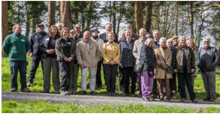
Branch members, National Trust staff and others who attended the opening of the new Penjerrick Walk at Bodnant