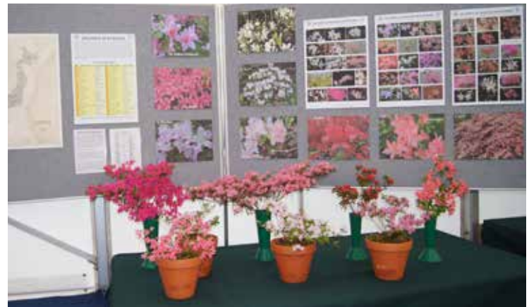
The Show theme, with Wilson's 50 Azaleas from the Isabella Plantation.

For a report see the chairman's note on p.1