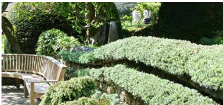
The clipped Cedrus atlantica at York Gate.

The garden contains a huge variety of perennials, shrubs and trees all looking extremely healthy in an entirely weed free environment! York Gate is now owned by the charity Perennial and run entirely by volunteers who not only maintain it to perfection but endeavour to retain the qualities set out by the Spencer family.