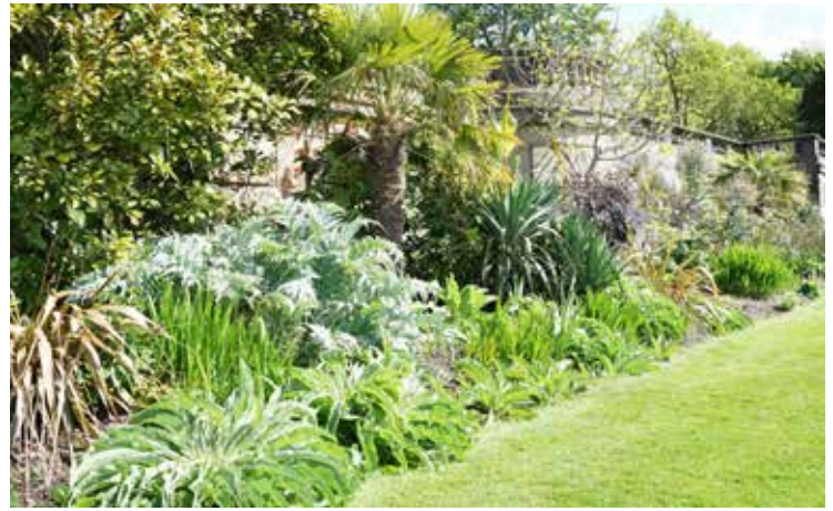
The Archery walk below the terrace at Harewood House.