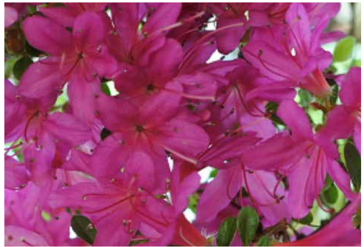
Rhododendron 'Hatsugiri' exhibited by the Ray Wood Volunteers, Yorkshire Arboretum, at the RHS Harlow Carr Show.

France or Germany next year, but members expressed a preference to visit the gardens of Northern Ireland, so we are actively investigating this for next year. (Please note, this was suggested before the recent DUP agreement!)