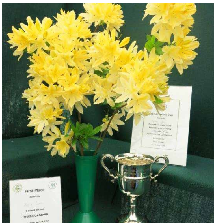
The Judges' decision. Winner of the Centenary Cup. Deciduous azalea: name unknown.