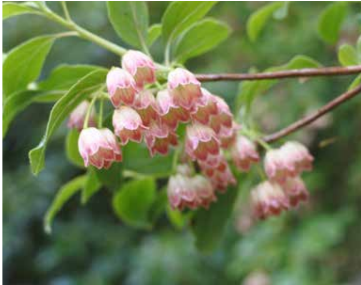
Enkianthus campanulatus 'Donardensis'.