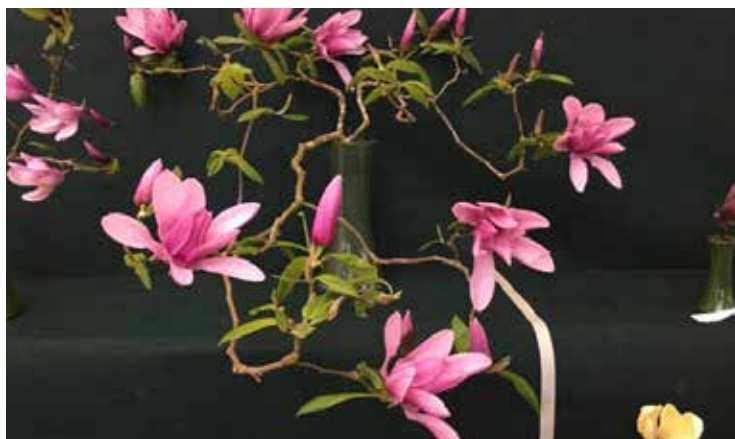
Winning spray of Magnolia 'Caerhays Surprise'