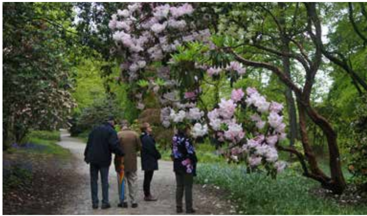
Some of the group enjoying Rhododendron 'Loderi King George'.