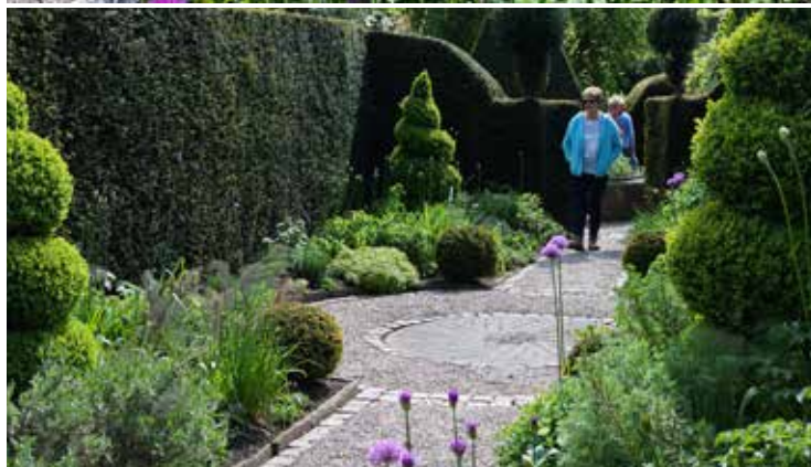
Further views of the garden at York Gate.