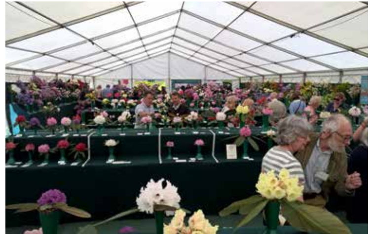
General view of the show at Savill.