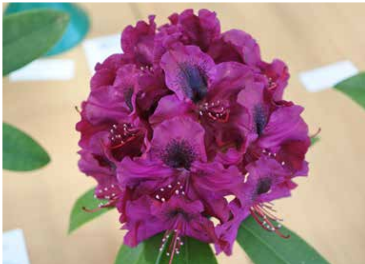
Rhododendron 'Olin O Dobbs' exhibited by the Crown Estate.