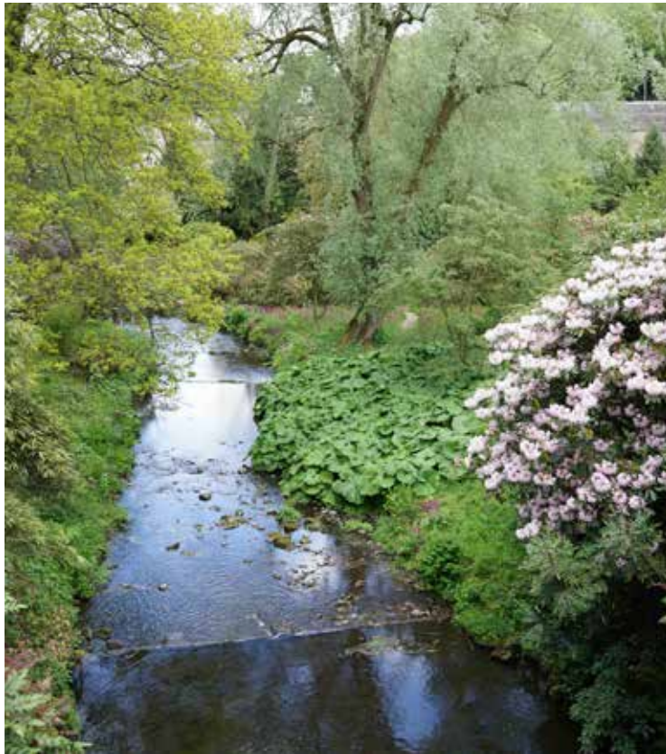
View from the bridge in the Himalayan Gardens at Harewood House.

After the Himalayan Gardens the group split up to enjoy other aspects of the gardens, the house and the café. One of the group discovered a book on “Chinese” Wilson for sale among second-hand books, whilst others visited the house and even an antique fair.