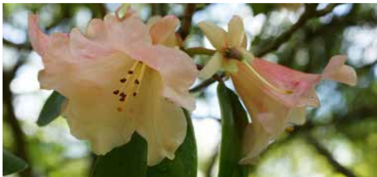
Rhododendron coriaceum (as labelled)