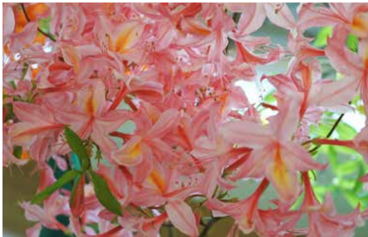
Rhododendron 'Tower Dragon' exhibited by the Crown Estate.