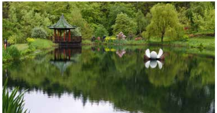
A view of the lake and magnolia sculpture.